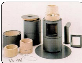
Modular components allowing speedy assembly

For heating water a wood-fired boiler should be used.